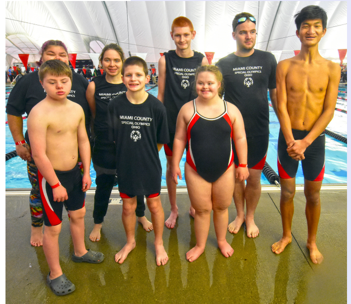
Members of the Miami County Special Olympics Swim Team prepare to compete at the Southwest Ohio Regional Tournament in Cincinnati.