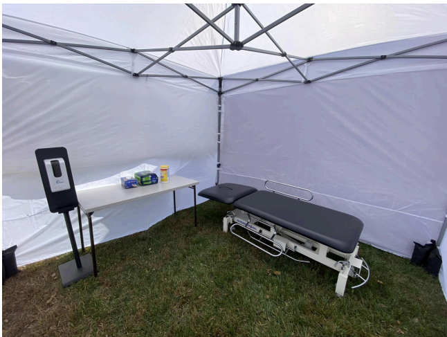
Being included in the community is central to our mission.