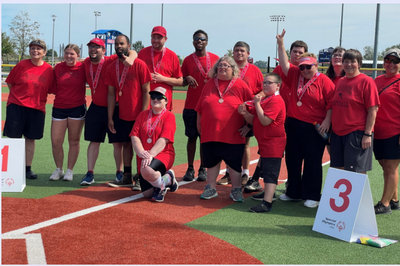
<< Softball team at the State Tournament

This fall, our Powerlifting, Swim, Basketball and Cheerleading teams are busy with practices and competitions. Stay tuned to our Facebook page and website for updates on games and tournaments, and come out when you can to cheer on our Miami County Magic!