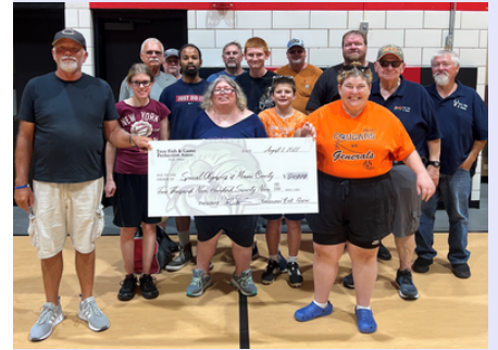
Troy Fish & Game donated $4,979 for the purchase of a new scoreboard for Special Olympics games

>> The Elliott Mote Memorial West Milton VFW Post 8211 Auxiliary raised $6,000 for Miami County Special Olympics at its 32nd annual fundraiser