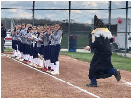
Piqua High School Softball players raised $1,500 for Miami County Special Olympics

We are incredibly fortunate to have the support of so many in our community, such as these generous organizations that recently made donations to our programs. With support like this, we are able to continue delivering on our mission of empowering people with developmental disabilities to live, work and play as full members of our community! We extend our sincere thanks to: