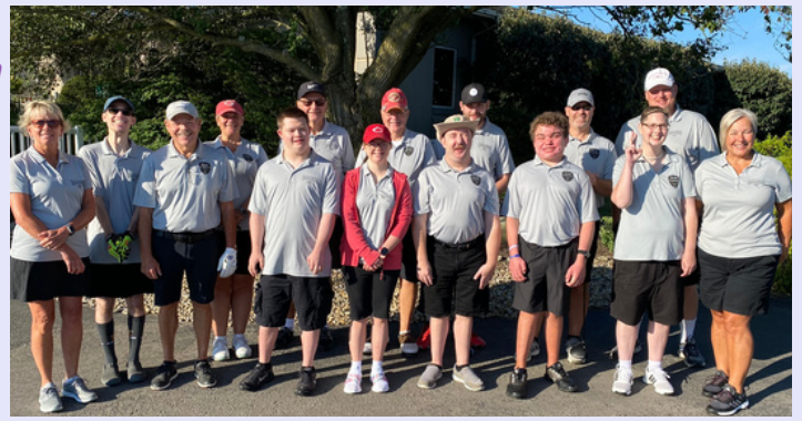
>> Golf team at the Regional Tournament