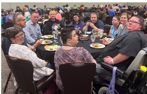
Miami County advocates attended the Synergy Conference in Sandusky to learn about speaking up for themselves, making good choices and gaining skills to grow their independence