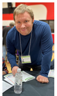
Austin completes an activity during the Regional Advocacy Conference